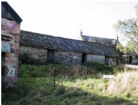
Fig. 7 : northern (front) elevation