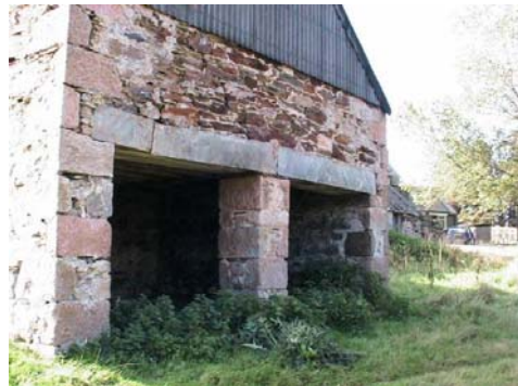
Fig. 8 : northern elevation