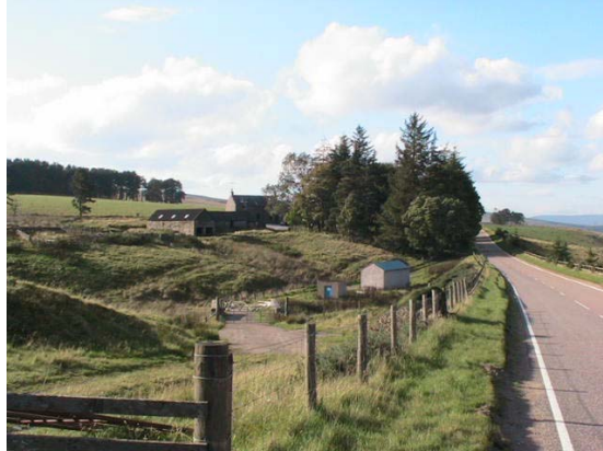
Fig. 9 : Approaching the proposed site from the east

the proposed new development. A set of conditions have been recommended to be attached in the event of the granting of planning permission. Conditions include the provision of adequate on site car parking provision and a turning facility within the curtilage of the site, and also stipulations regarding surfacing between the edge of the public road and the proposed gate.