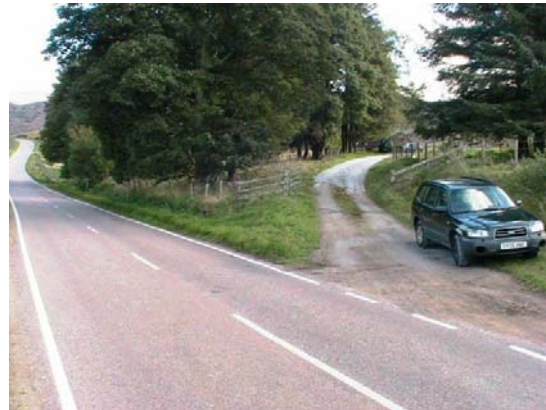
Fig. 10 : Existing access off the A939 serving Blairnamarrow steading and adjacent dwelling house