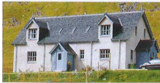
Fig. 4 : Built example of indicative house type