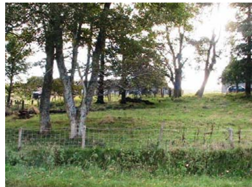
Figs. 11 & 12 : general location of proposed new access off the A939