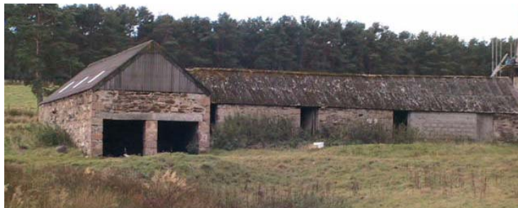
Fig. 2 : Existing steading at Blairnamarrow