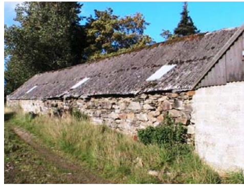
Fig. 6 : southern (rear) elevation