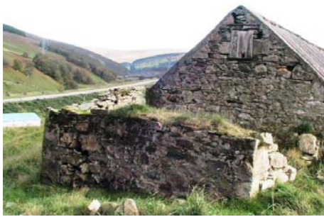
Fig. 5 : western elevation